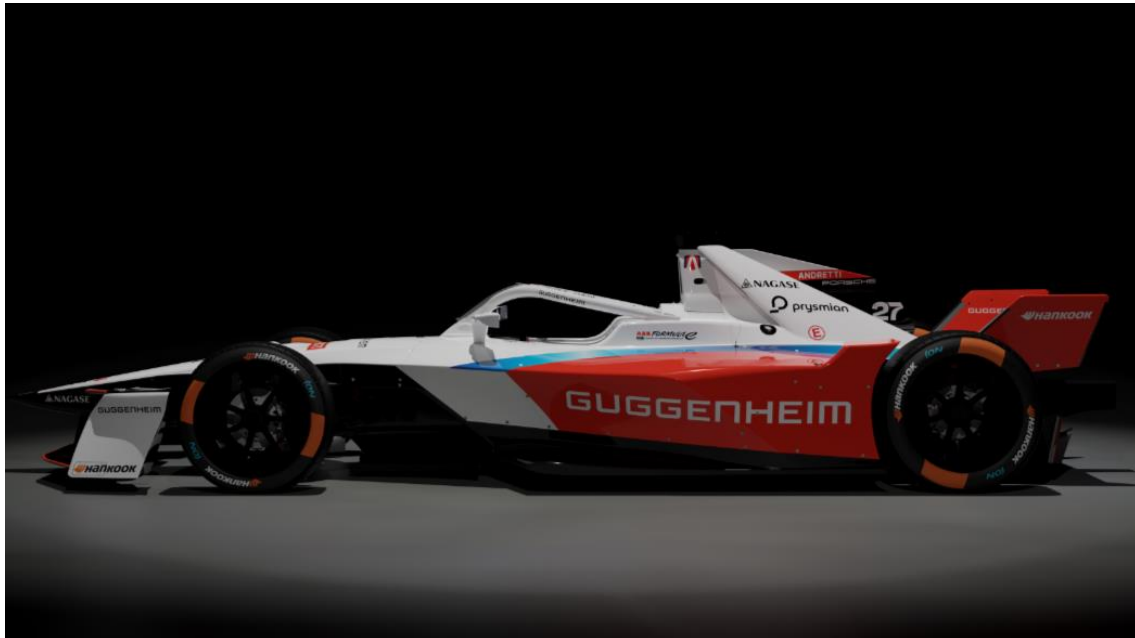
Andretti Formula E Team race car

firm our aim is to achieve net zero carbon emissions across the entire supply chain, we have also learned a lot from Formula E's approach to environmental issues.”