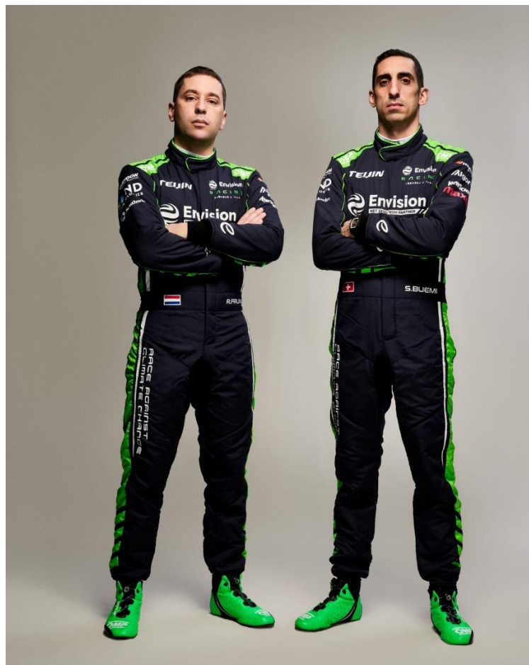
Racing suits worn by the drivers of the Envision Racing Formula E Team are made of Teijin's Teijinconex ® aramid fiber.

While passing rigorous tests in line with FIA (Federation Internationale de l'Automobile) standards, the company succeeded in reducing the weight and improving the comfort of the drivers' suits. This has opened the door for new applications for Teijinconex ® , which until now had primarily been used for firefighting uniforms.