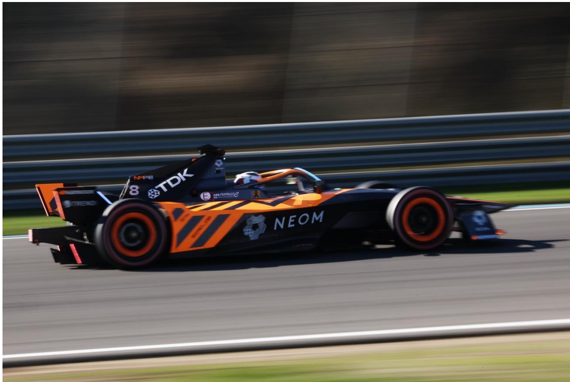
The Neom McLaren Formula E Team race car