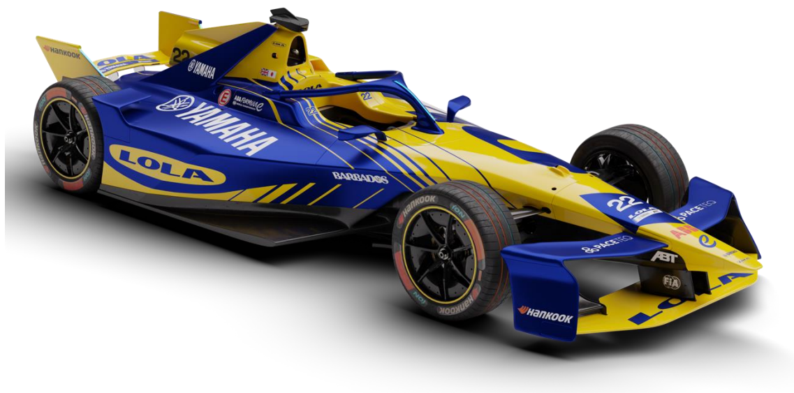
The Lola Yamaha ABT Formula E Team race car, Lola T001

Because Formula E is built around the idea of sustainability, it is not only about how fast you can go but also how efficiently you can maximize your usable energy. For a manufacturer of diverse range of mobility options like Yamaha Motor, electrifying powertrains and improving energy efficiency are certainly issues that need to be addressed. We hope to forge and perfect new EV technology in collaboration with Lola under the high-pressure environment that is EV racing.”