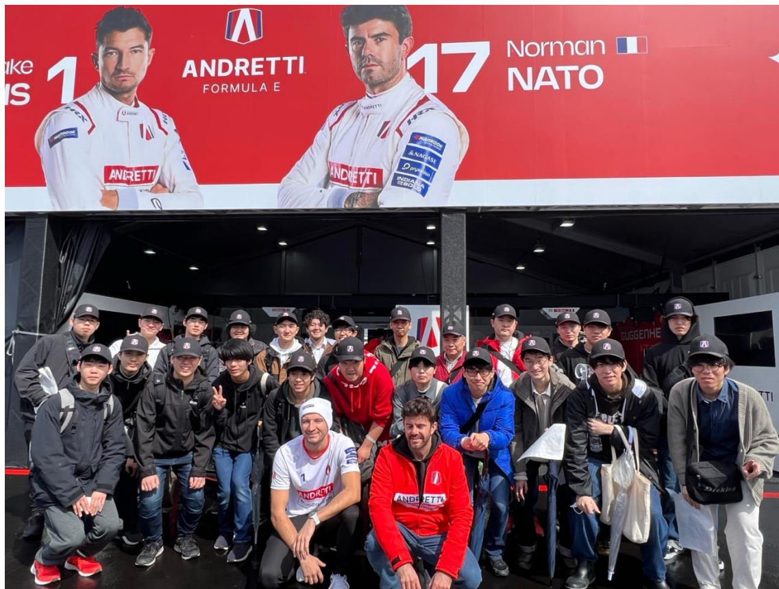
Twenty-four students from Tokyo Metropolitan Sogo Kouka High School participated in last season's garage tour